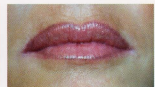
AFTER Esthélis Soft treatment